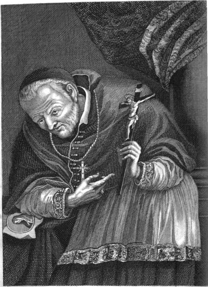
S T . ALPHONSO LIGUORI.